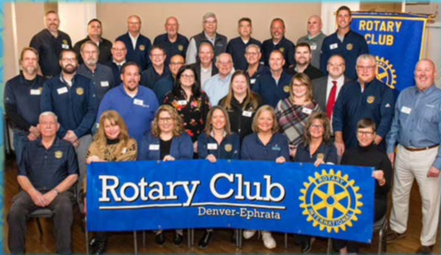
DENVER-EPHRATA AREA ROTARY CLUB