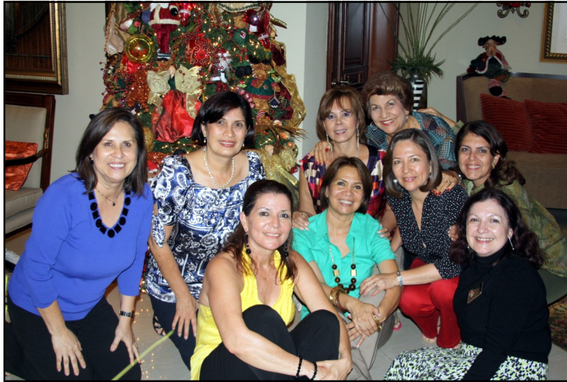
Saw my first Christmas tree of the year at the going-away party in Ecuador on November 14. Pictured with doctors, translators and new friends of the Rotary Club of Guayaquil Sul.

far enables men to do things they did not dream themselves capable of before, and which they were not capable of alone. The consciousness of belonging, vitally, to something beyond individuality; of being part of a personality that reaches we know not where, in space and time, greatness the heart to limits of the soul's ideal, and builds out the supreme of character." In 1914 Paul Harris could very easily have said these words. He said so many similar phrases that have inspired the spirit of Rotarians and dedication to Rotary ideals. But these thoughts are actually the words of Lieutenant Colonel Joshua Chamberlain, American Civil War Hero. Both great men in their own